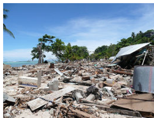
Giso after 2007 Solomon Tsunami