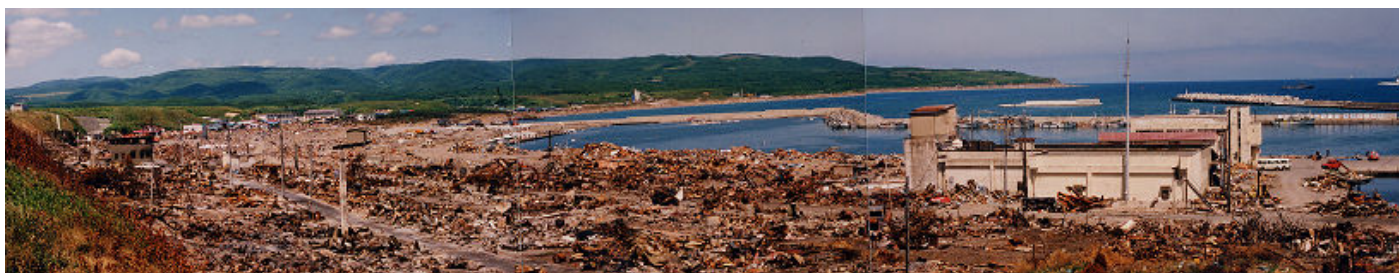
Okushiri after 1993 Hokkaido-Nansei-Oki Tsunami